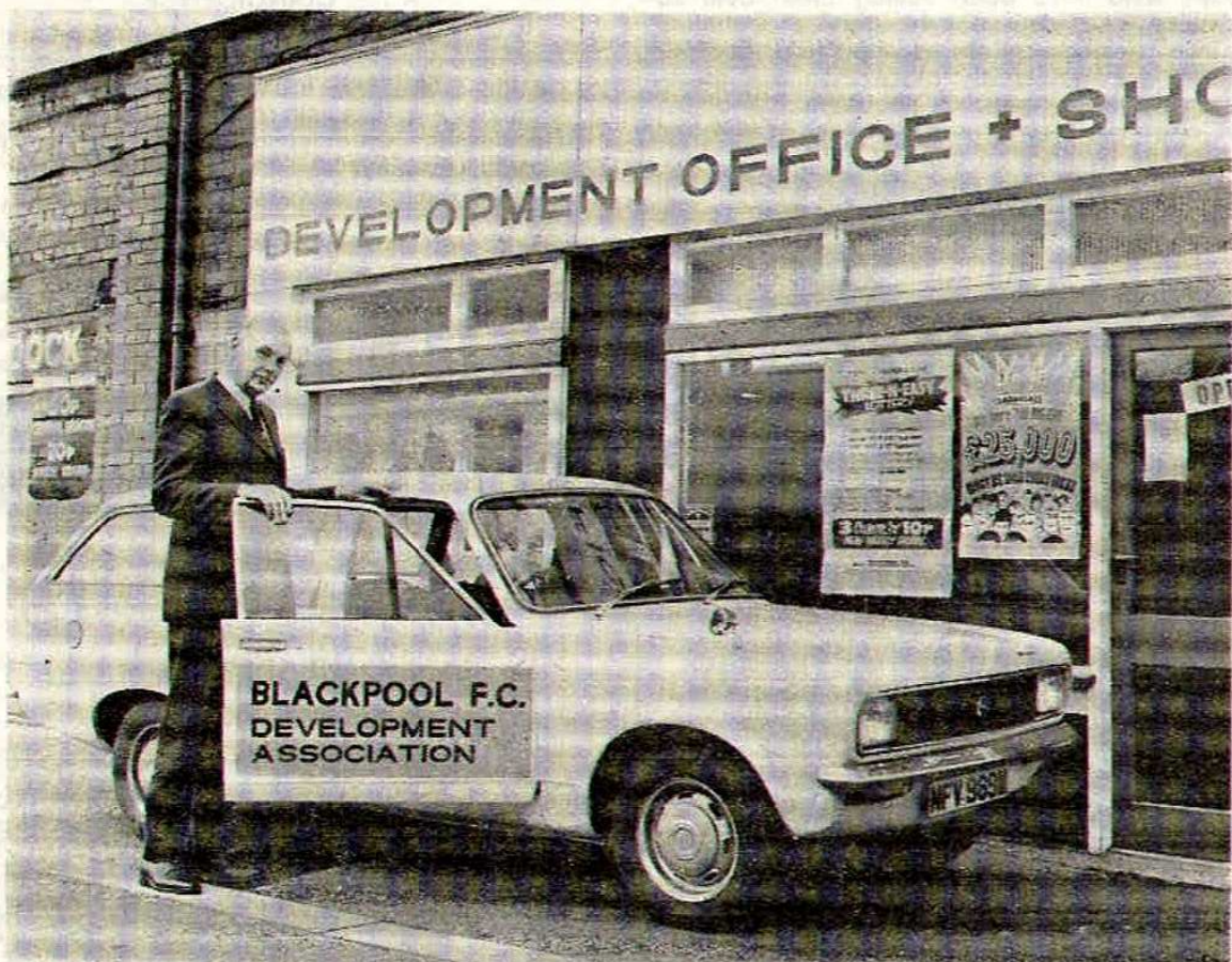
This vehicle was supplied by Woodheads Garage, Squires Gate, Blackpool.